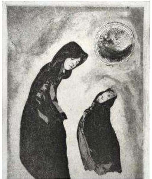
Waiting for the World to End